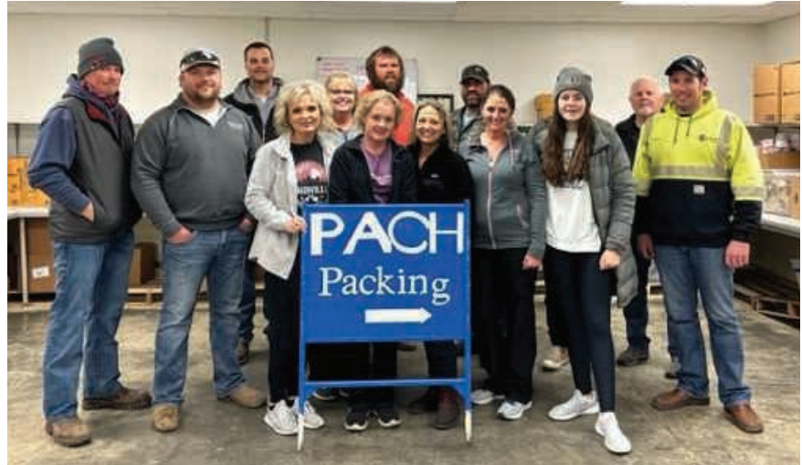
Co-op employees lend a hand to assist Watertown Area PACH

Codington-Clark Electric Cooperative, Inc. is an equal opportunity provider and employer.