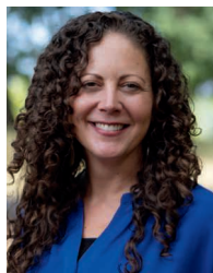
Miranda Boutelle Efficiency Services Group

I installed a heat pump water heater in my home. I love it and can see how my energy use has decreased since installation. Now, if I can only figure out how to get my children to take shorter showers.