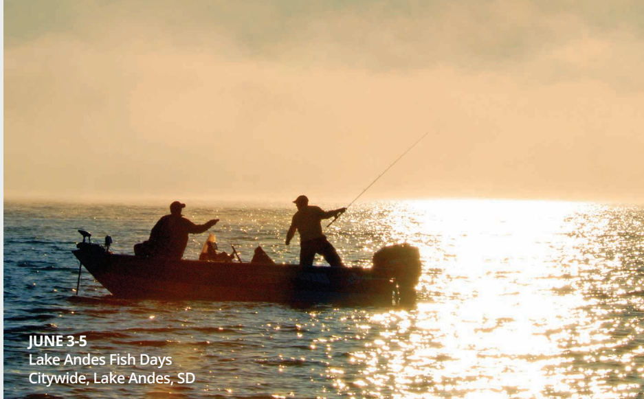
JUNE 3-5 Lake Andes Fish Days Citywide, Lake Andes, SD

To have your event listed on this page, send complete information, including date, event, place and contact to your local electric cooperative. Include your name, address and daytime telephone number. Information must be submitted at least eight weeks prior to your event. Please call ahead to confirm date, time and location of event.