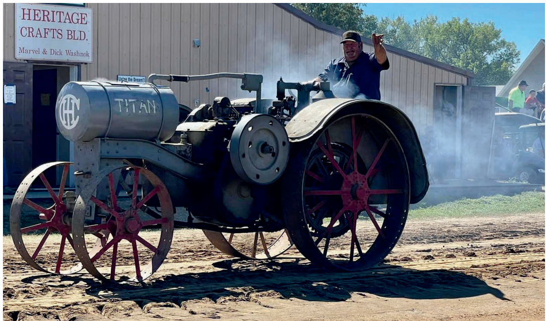
A parade with more than 250 entries each year is one of the most popular events during the James Valley Threshing Show in Andover each September.