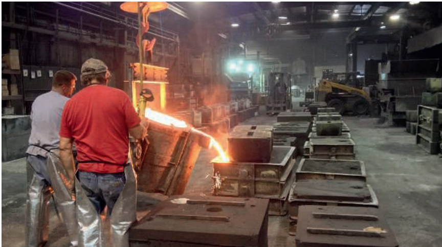
It took nearly 10 years to build a Case 150-horsepower steam-powered tractor from scratch.

Not with the Ladies of Steam. The program is run by women and offers other women a chance to learn about and ride an old-fashioned steam tractor.