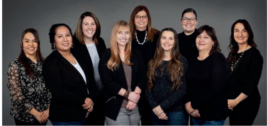
Four Bands Community Fund's team of highly qualified staff.