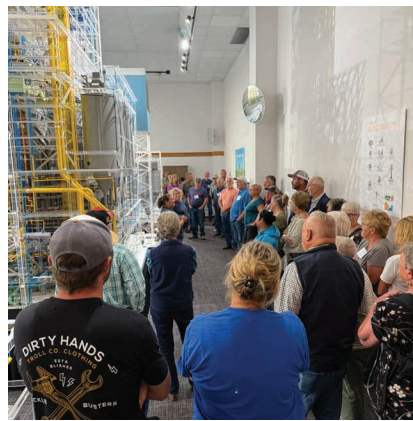
Members tour the model room at Antelope Valley Power Plant.