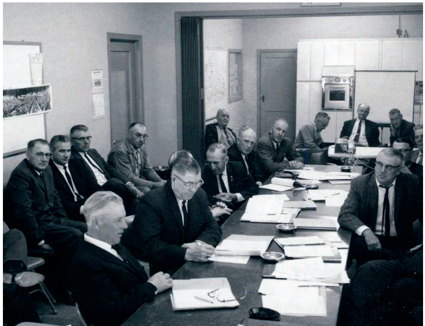
(Top) A West Central Electric Annual Meeting. (Bottom) A West Central Electric Board Meeting with the REA.