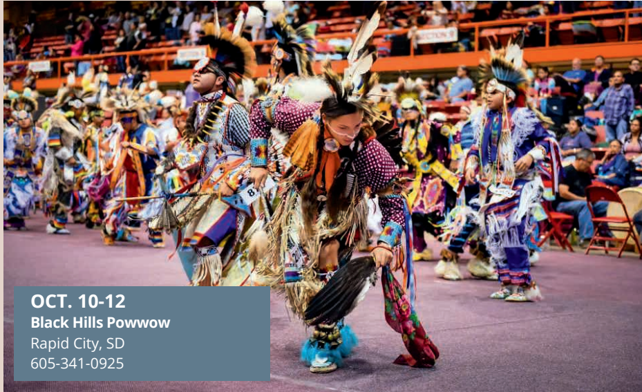
OCT. 10-12 Black Hills Powwow Rapid City, SD 605-341-0925

To have your event listed on this page, send complete information, including date, event, place and contact to your local electric cooperative. Include your name, address and daytime telephone number. Information must be submitted at least eight weeks prior to your event. Please call ahead to confirm date, time and location of event.