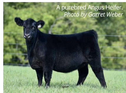
A purebred Angus Heifer.