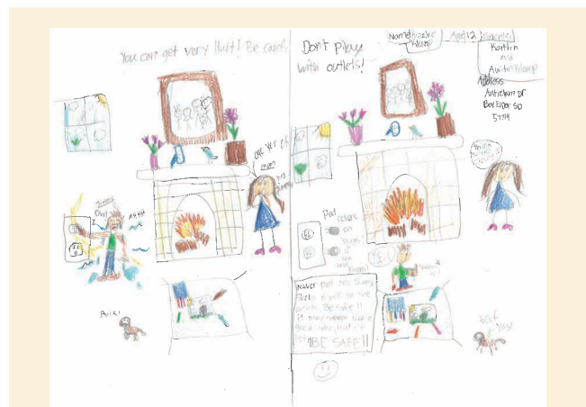
"Don't play with outlets!"

While rare, the only reason to exit equipment that has come into contact with overhead lines is if the equipment is on fire. However, if it happens, jump off the equipment with your feet together and without touching the machinery and the ground at the same time. Then, still keeping your feet together, hop to safety as you leave the area.