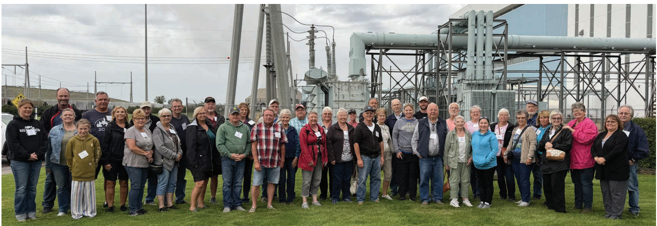
Members on the Basin Tour pose for a group photo.