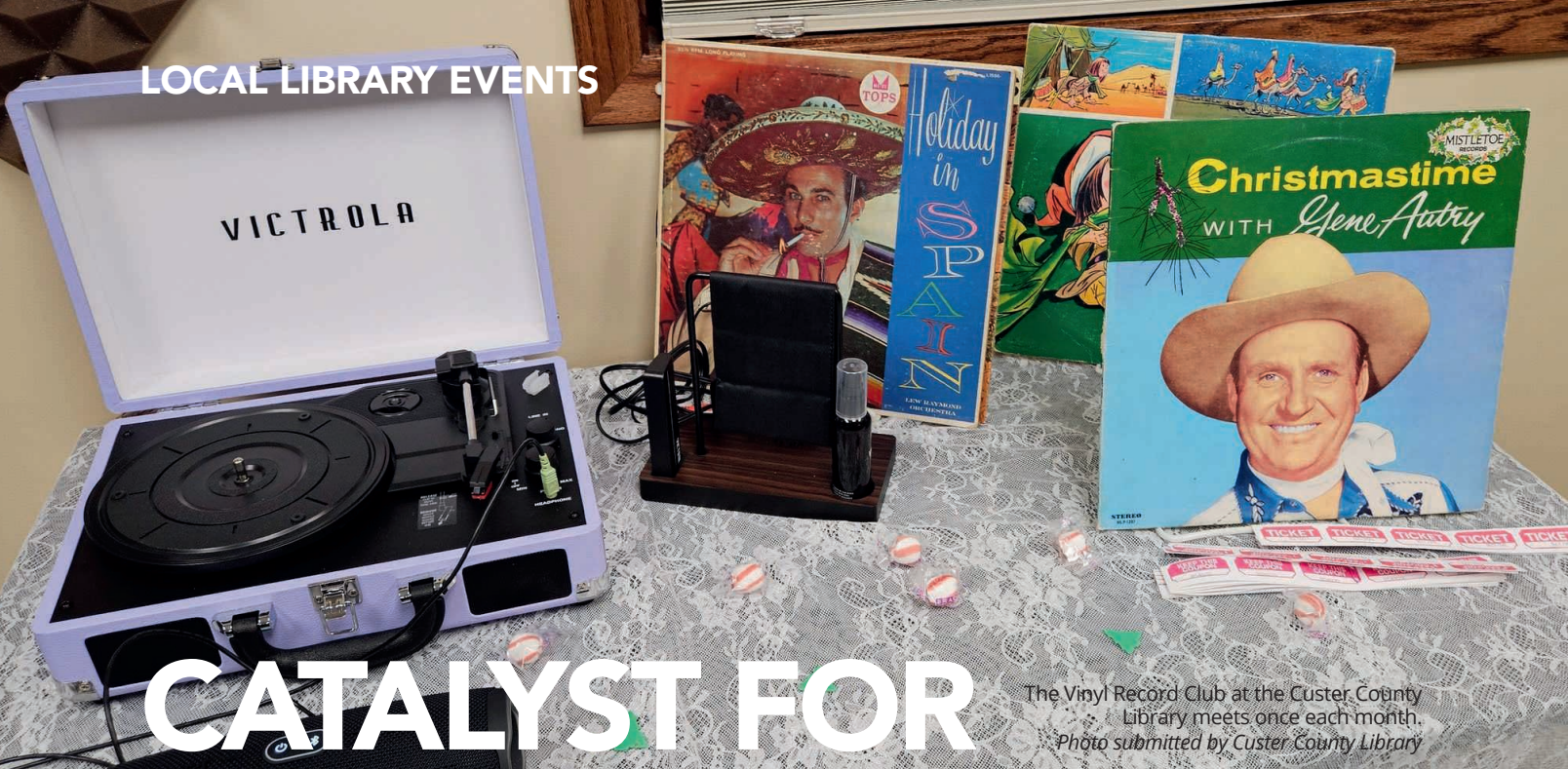
The Vinyl Record Club at the Custer County Library meets once each month.