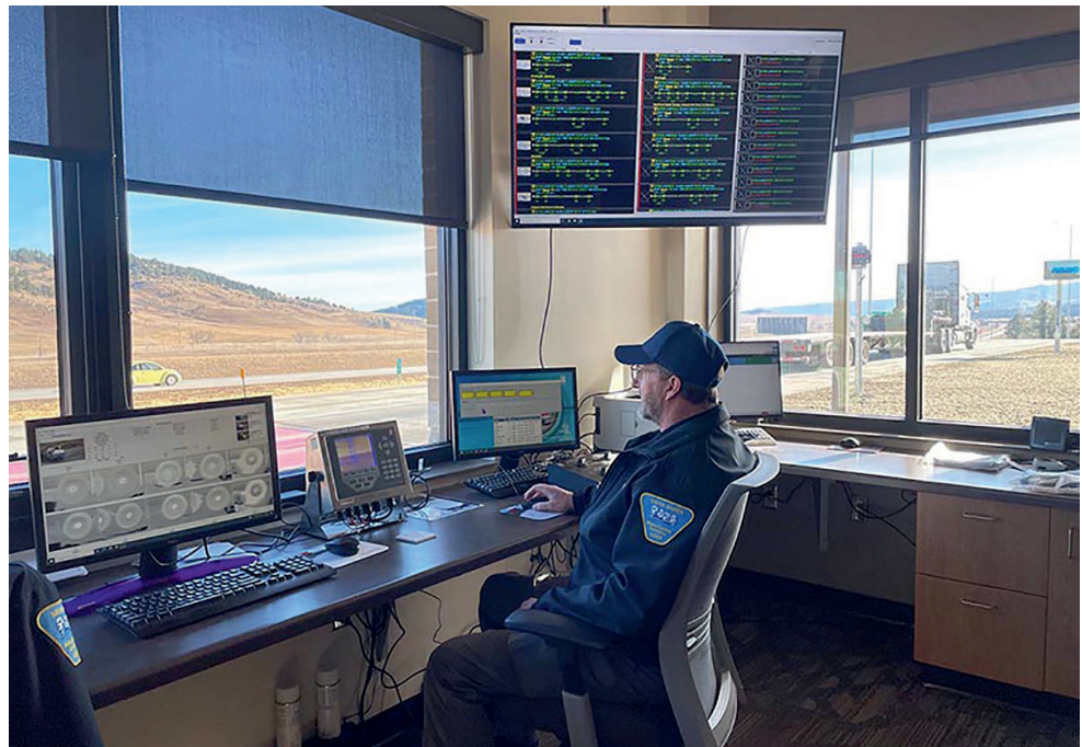
A SDHP officer has the latest technology at his or her fingertips to ensure trucks on South Dakota roads are operating safely.

"It's kind of nice to be able to do that and make the day what you want of it."