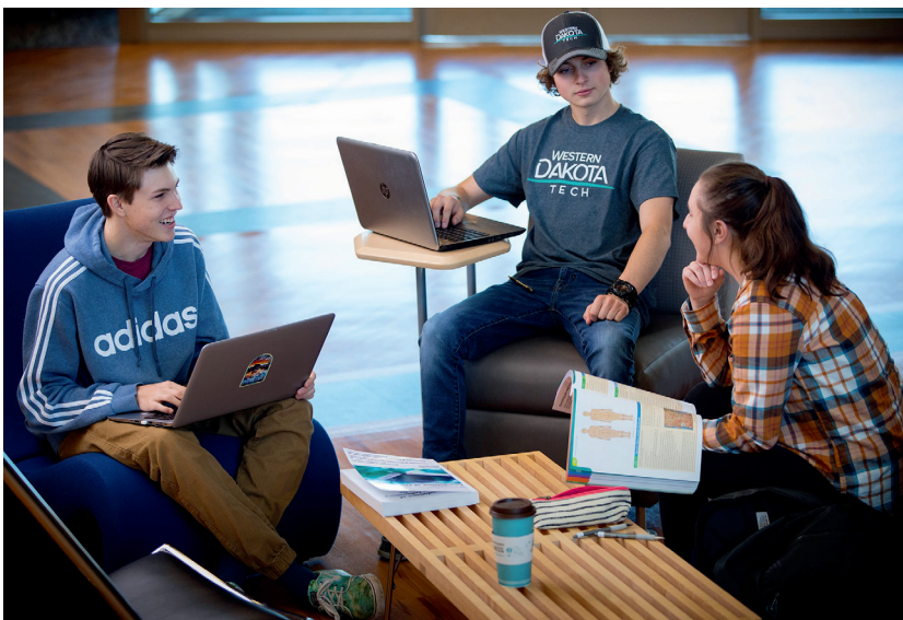
Students enrolled in Western Dakota Technical College's Dual Credit Program.

For more information on enrolling in the dual credit program, students and parents should reach out to their high school counselor's office or check out the options at https://ourdakotadreams.com/high-school/dual-credit/ .