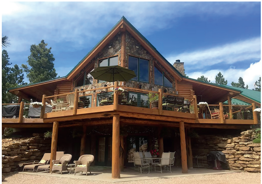
Log cabin in Vanocker Canyon