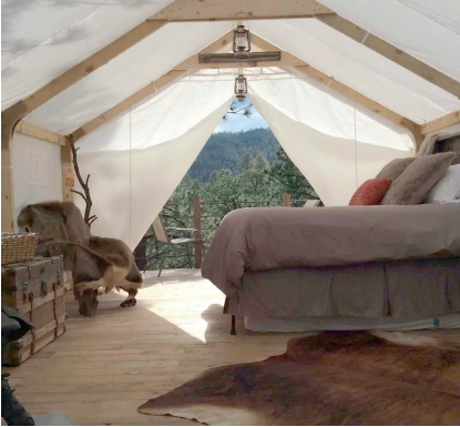
The Still House near Rapid City