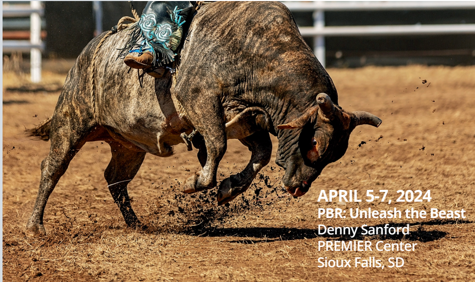
APRIL 5-7, 2024 PBR: Unleash the Beast Denny Sanford PREMIER Center Sioux Falls, SD

To have your event listed on this page, send complete information, including date, event, place and contact to your local electric cooperative. Include your name, address and daytime telephone number. Information must be submitted at least eight weeks prior to your event. Please call ahead to confirm date, time and location of event.