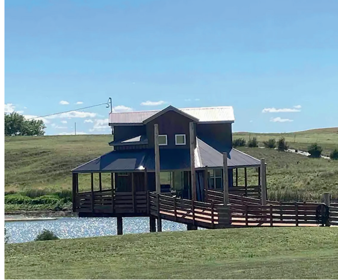
Cabin over water on the prairie near Philip